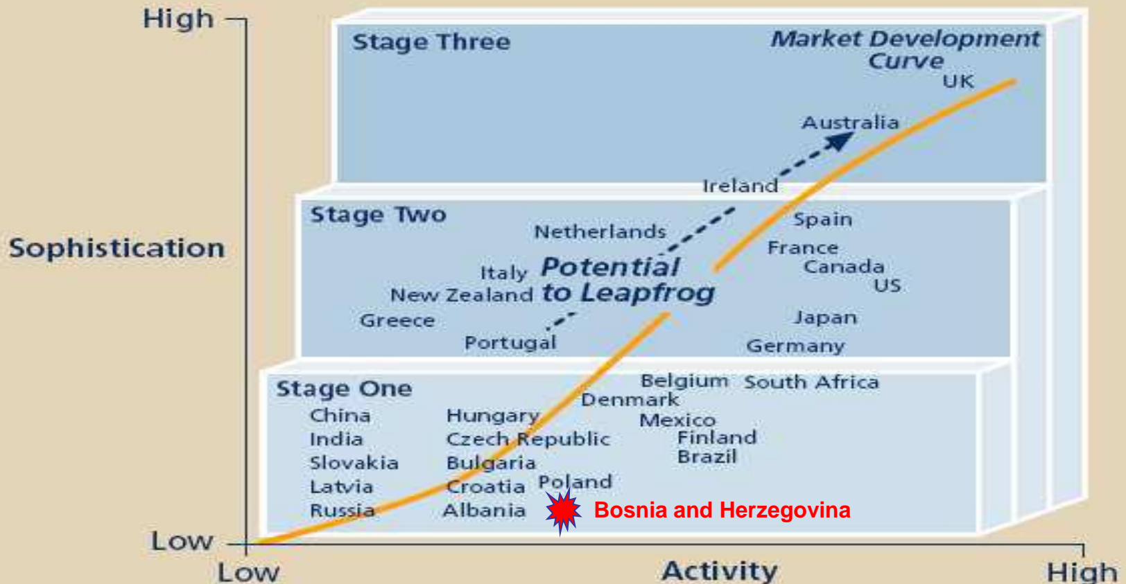
Figure 2. PPP Market Maturity Curve

Bosnia is certainly below the curve in this diagram This is a very, very dangerous